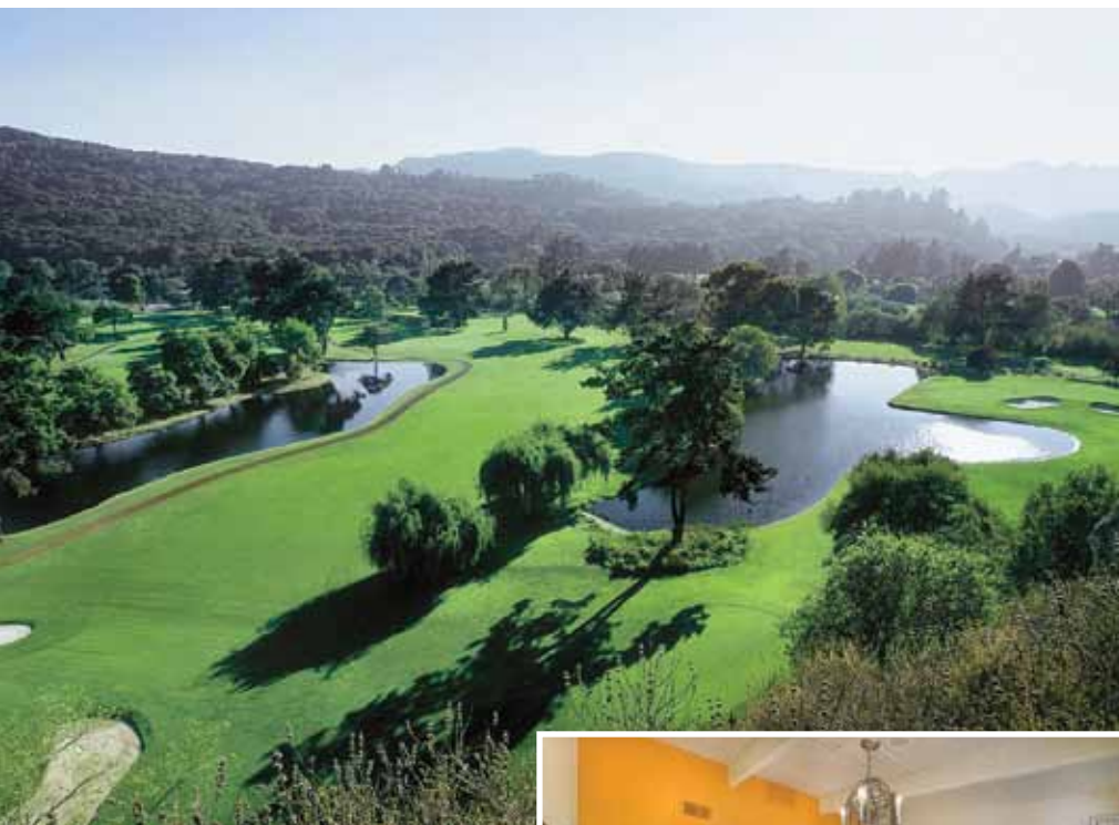
ABOVE: The beautifully manicured par-71 golf course features 10 glistening lakes (or water hazards, depending on your perspective). RIGHT: California ranch is the décor in all guest rooms, which have hardwood floors, a balcony or patio, and Wi-Fi.